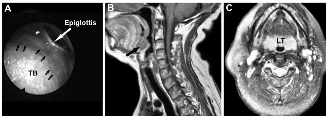
Figure 2 (A) Bulk of the lingual tonsils obscure visualization of the root of the epiglottis/valleculae on nasoendoscopic examination. Black arrows delineate border of lingual tonsils and tongue base (TB). (B) Sagittal MRI depicting enlarged lingual tonsils (black arrow) filling the vallecular space and tipping the epiglottis posteriorly. (C) Contrast-enhanced axial MRI depicting highlighted region of lingual tonsils (LT) obstructing the airway.

The reduced morbidity of the device expands the potential indications for lingual tonsillectomy. Aside from massive hypertrophy, patients with OSA may be candidates if the bulk of the lingual tonsils obscure visualization of the root of the epiglottis/valleculae on supine awake nasoendo-