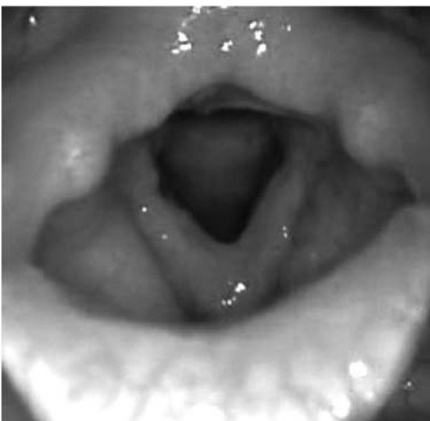
FIG. 2 Post-operative view in abduction.

In the first case, an Evac 70 wand (Arthrocare, Sunnyvale, California, USA) delivering simultaneous saline irrigation and suction was used throughout, with an ablation setting of five and coagulation setting of three. By placing the wand near the lesions, the suction drew the papillomata onto the wand tip, where they were each ablated with short bursts of energy until no macroscopic disease was visible. No bleeding occurred at any stage and no physical contact pressure was applied to the underlying tissues. There was no disease present in the subglottis, which was fortunate as this particular wand was working at its maximum extent. No protection of the endotracheal tube was necessary, and care was taken to aspirate any and all saline from the glottis and trachea as the procedure progressed. It